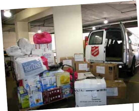
On December 17th, a Salvation Army van pulled into our loading dock to collect supplies donated by 411 East Wisconsin Center.

❄ United Way . . . in a big way! A human chain stretching several blocks from Johnson Controls headquarters to 411 East Wisconsin